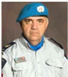
END OF WATCH Jan 12, 2010