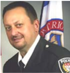
END OF WATCH Dec 29, 2009