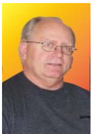
From the Editor's Desk

I don't know about you, but many times I am caused to wonder just how my heavenly Father sees me.