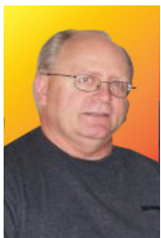
From the Editor's Desk

I don't know about you, but many times I am caused to wonder just how my heavenly Father sees me.